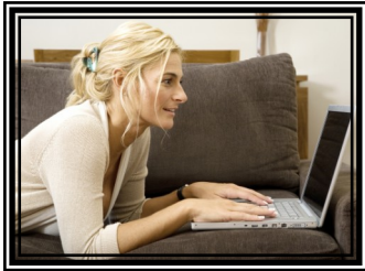
Sign-Up To Attend Your Favorite Women's Week Activity NOW!

The 2009 Women's Week Activity Booklets will be available by the end of August – BUT, you don't have to wait for the booklet to sign-up for any activities that you want to attend if they require an RSVP.