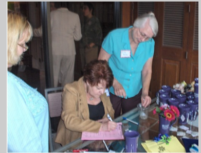
Women's Council members assist a new member with her application.

Thanks to all the Tea-rrific women who supported us to make this event a success including all who got the word out, all who attended, all of the Membership Committee and all those who joined our organization today.