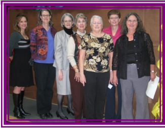
Some Meet & Greet Attendees pose for a picture Thursday.

The Women's Council of Greater Baton Rouge held its Fall Meet and Greet Open House at the First United Methodist Church on Thursday, November 12. Twenty-eight members