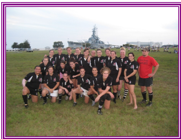
The Baton Rouge Lady Barbarians rugby team.

The ladies rugby team has been a busy group of women over the last several weeks. These women are a relatively new addition to the Baton Rouge Women's Council, but are excited to be part of the council. In the last few weeks the Barbarians, or rather, the "Barbies", have been, not only traveling across the South East playing rugby, but they have been involved with the local community as well. Click here to read more about what they've been doing in our community and on the field.