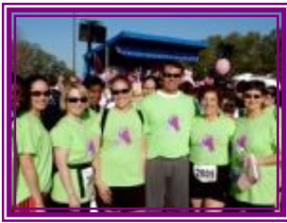
WC members and friends at 2009 Race for the Cure

Come join us to celebrate the 25th anniversary of the Susan G Komen Race for the Cure for breast cancer on Saturday, March 7, 2010.